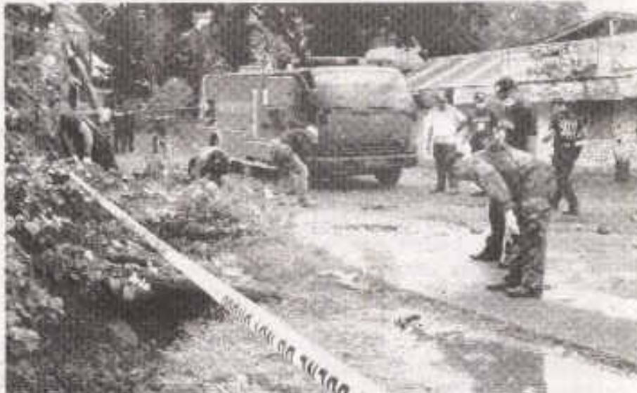
POLICE operatives conduct an investigation in front of the Kidapawan City Jail where an improvised bomb exploded past 9 p.m. Sunday as gunmen stormed the facility. The attack left three people dead and 15 others wounded.