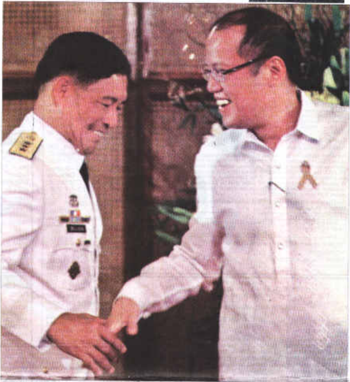
It's official. President Aquino congratulates AFP chief Lt. Gen. Jessie Dellosa after administering the oath of office at Malacañan Palace. Next on the agenda: Promotion to the rank of General. Dellosa is a member of the PMA Class '79.